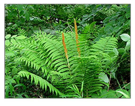
Cinnamon Fern in bloom