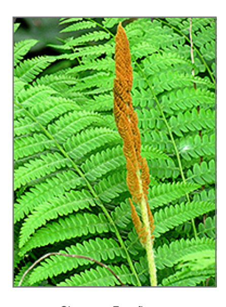
Cinnamon Fern flowers

Cinnamon Fern is recommended for the following landscape applications;