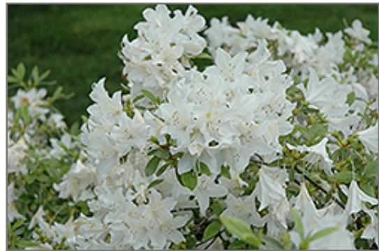
Cascade Azalea flowers