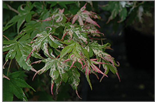
Oridono Nishiki Japanese Maple foliage