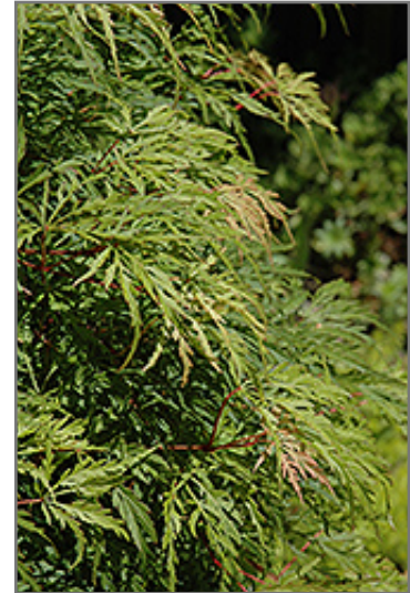
Palmatifidum Japanese Maple foliage

Palmatifidum Japanese Maple is recommended for the following landscape applications;