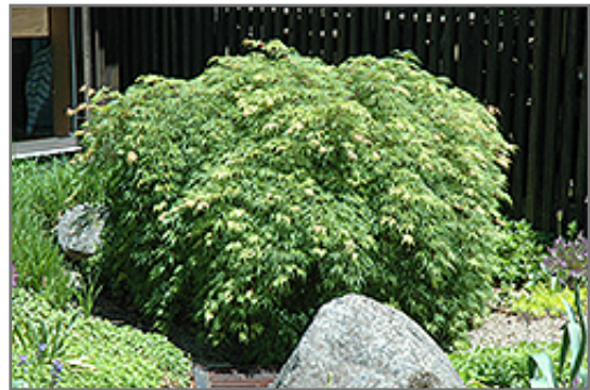
Palmatifidum Japanese Maple