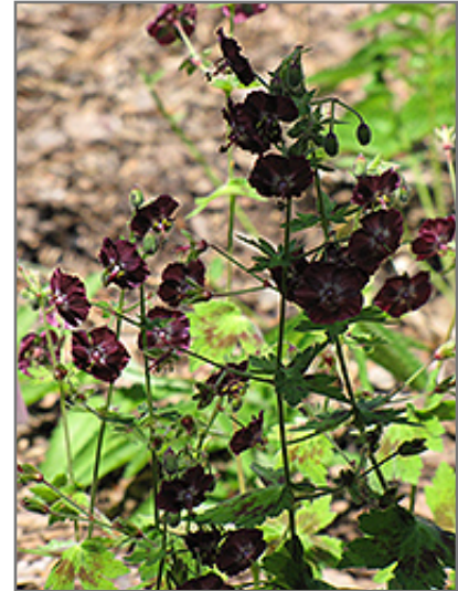
Samobor Cranesbill in bloom

Samobor Cranesbill is recommended for the following landscape applications;