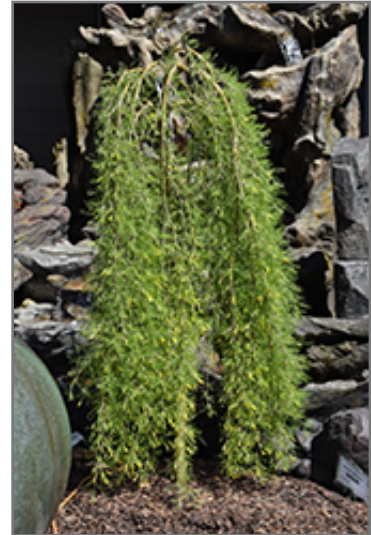
Walker Weeping Peashrub

Walker Weeping Peashrub is ideal for use as a garden accent or patio feature, and is recommended for the following landscape applications;