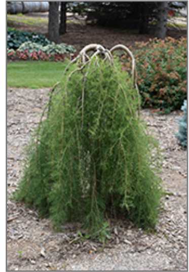
Walker Weeping Peashrub

This dwarf tree does best in full sun to partial shade. It prefers dry to average moisture levels with very well-drained soil, and will often die in standing water. It is considered to be drought-tolerant, and thus makes an ideal choice for xeriscaping or the moisture-conserving landscape. It is not particular as to soil type or pH, and is able to handle environmental salt. It is highly tolerant of urban pollution and will even thrive in inner city environments. This is a selected variety of a species not originally from North America.