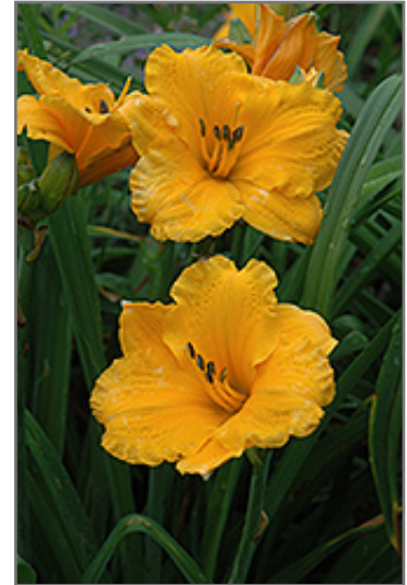
Chicago Sunrise Daylily flowers

Chicago Sunrise Daylily will grow to be about 24 inches tall at maturity extending to 3 feet tall with the flowers, with a spread of 24 inches. When grown in masses or used as a bedding plant, individual plants should be spaced approximately 18 inches apart. It grows at a medium rate, and under ideal conditions can be expected to live for approximately 10 years. As an evergreen perennial, this plant will typically keep its form and foliage year-round.