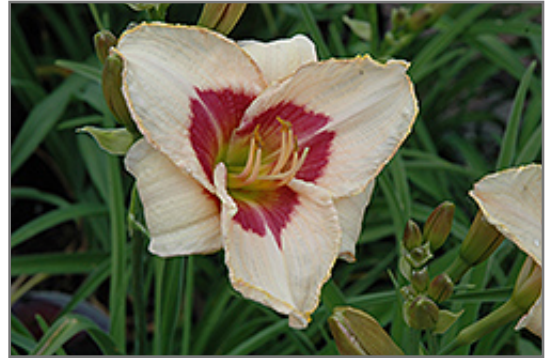
Siloam Gumdrop Daylily flowers