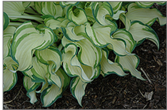
Ghost Spirit Hosta foliage