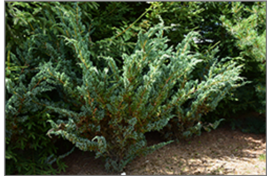
Meyer Juniper