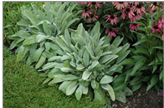
Fuzzy Wuzzy Lamb's Ears