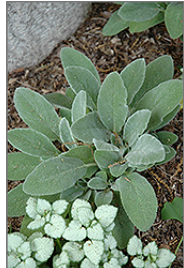
Fuzzy Wuzzy Lamb's Ears foliage