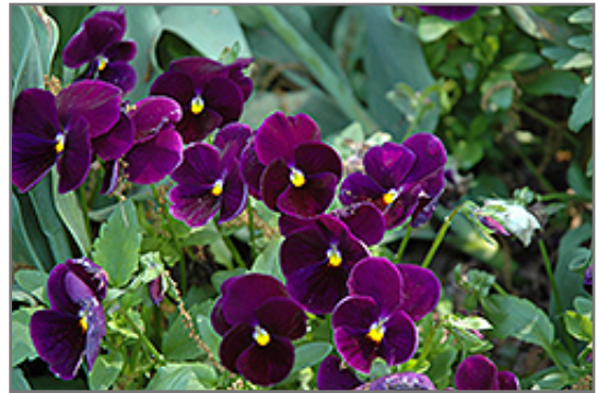
Matrix Purple Pansy flowers

Matrix Purple Pansy is recommended for the following landscape applications;