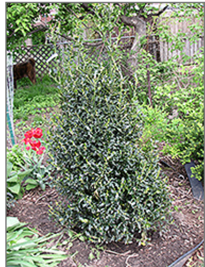
Golden Girl Meserve Holly