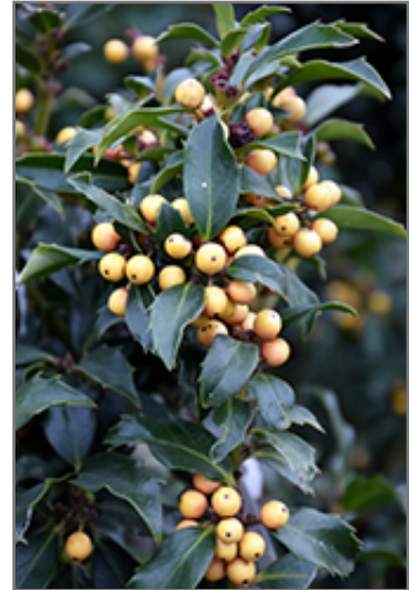
Golden Girl Meserve Holly fruit

Golden Girl Meserve Holly is recommended for the following landscape applications;