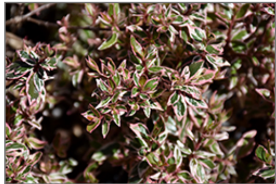
Confetti Abelia foliage