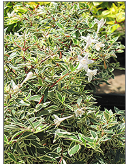
Confetti Abelia in bloom

Confetti Abelia is recommended for the following landscape applications;