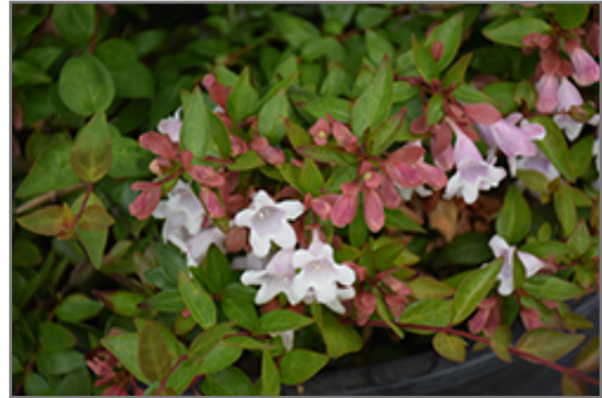
Edward Goucher Abelia flowers

Edward Goucher Abelia is recommended for the following landscape applications;