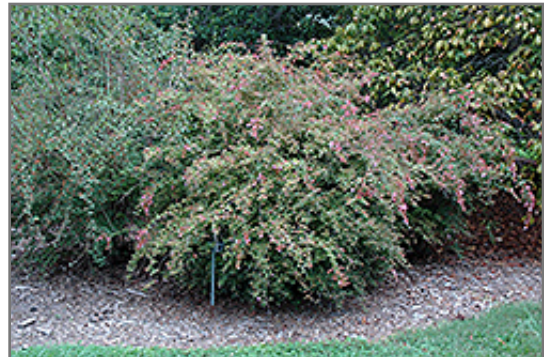
Edward Goucher Abelia in bloom