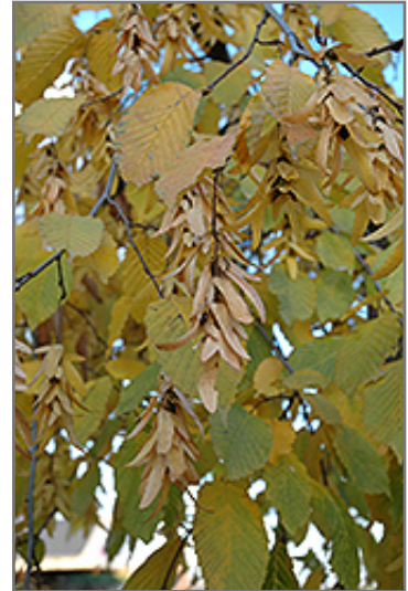
Weeping European Hornbeam in fall