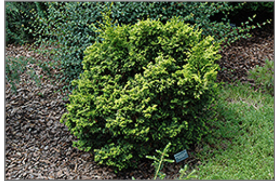
Kanaamihiba Hinoki Falsecypress