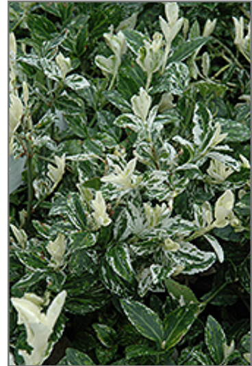
Harlequin Wintercreeper foliage

Harlequin Wintercreeper will grow to be about 12 inches tall at maturity, with a spread of 24 inches. It tends to fill out right to the ground and therefore doesn't necessarily require facer plants in front. It grows at a slow rate, and under ideal conditions can be expected to live for approximately 30 years.