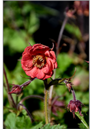
Flames of Passion Avens flowers

Flames of Passion Avens is recommended for the following landscape applications;