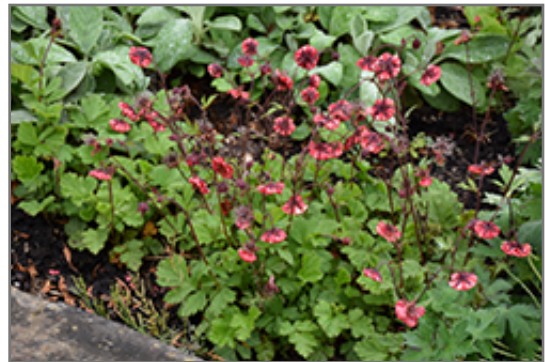
Flames of Passion Avens in bloom