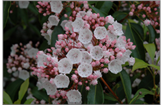
Elf Mountain Laurel flowers