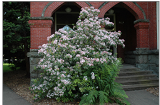
Elf Mountain Laurel in bloom