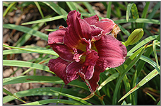
Double Grapette Daylily flowers