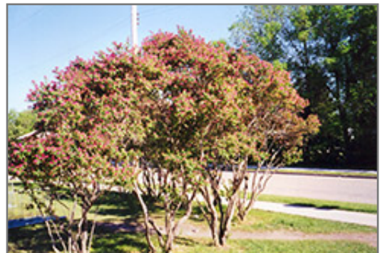
Arnold Red Tatarian Honeysuckle in bloom