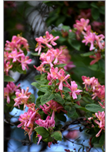
Arnold Red Tatarian Honeysuckle flowers

Arnold Red Tatarian Honeysuckle is recommended for the following landscape applications;