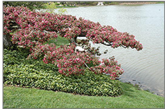
Candied Apple Flowering Crab in bloom